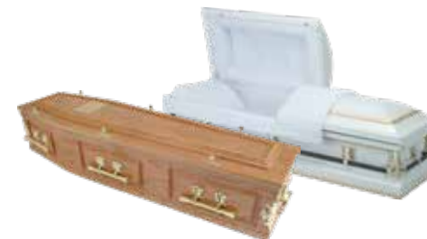
For prices and our full range of coffins & caskets please ask for brochure