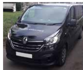
Modern and discreet private ambulance used to transport your loved one to the airport

We have a range of coffins and caskets suitable for international repatriation. All of our Metal American-Style Caskets are hermetically sealing and are suitable for international repatriation. They may be re-opened at the destination location and may also be used for burial in the destination country, local cemetery regulations permitting. Wooden coffins must be zinc lined (at an additional cost) for them to be hermetically sealed for repatriation.